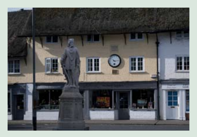
For further information visit www.visitpewseyvale.co.uk

8 Cross over the bridge and at the bend turn right by the old school building, into River Street. Walk along River Street to the Pedestrian crossing. Cross the road and continue past the King Alfred statue and shops to Goddard Road.