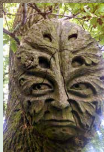
The Green Man

A carving in living wood created in or around 2005 by a local artist who remains anonymous.